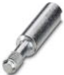
Coding peg for coding up to 16 connectors