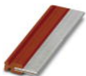
Plug-in bridge, length: 50 mm, color: red

Plug-in bridge - FBST 50-PLC RD - 1081050