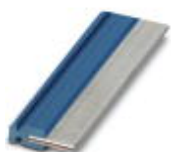
Plug-in bridge, length: 50 mm, color: blue

Plug-in bridge - FBST 50-PLC BU - 1081051