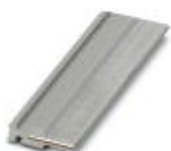
Plug-in bridge, length: 50 mm, color: gray

Plug-in bridge - FBST 50-PLC GY - 1081053