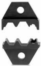
Spare die for CRIMPFOX-CX 6,48

https://www.phoenixcontact.com/us/products/1212286