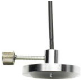
Polisher, made of metal, for CK1,6-...POF contacts, POF conductor diameter: 2.2 mm

Please be informed that the data shown in this PDF Document is generated from our Online Catalog. Please find the complete data in the user's documentation. Our General Terms of Use for Downloads are valid ( http://phoenixcontact.com/download )