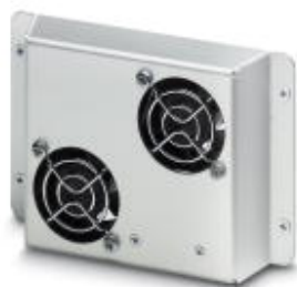
Fan module for Remote Field Controllers RFC 430 ETH-IB / RFC 450 ETH-IB

Please be informed that the data shown in this PDF Document is generated from our Online Catalog. Please find the complete data in the user's documentation. Our General Terms of Use for Downloads are valid ( http://phoenixcontact.com/download )