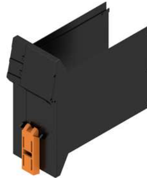
Base element without cut-out in snap-in foot area