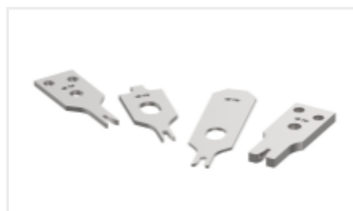
TE Part #9-1633965-2 CRIMPER, INSULATION O