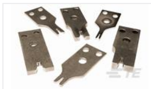
TE Part #4-1490019-2 CRIMPER, WIRE (.136" 'F')