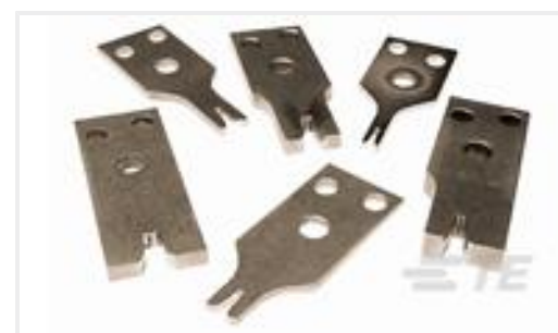
TE Part #1-1673600-8 CRIMPER, WIRE (.075" 'F')