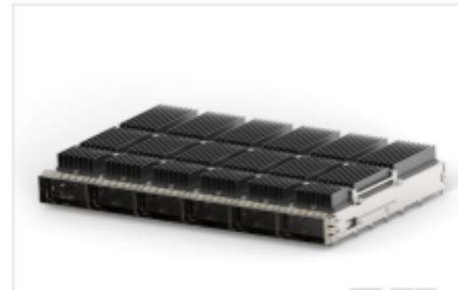
TE Part #2342891-2 CAGE ASSY 1X6 QSFP-DD HS EXTRUTION SAN