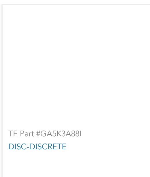
TE Part #GA5K3A88I DISC-DISCRETE