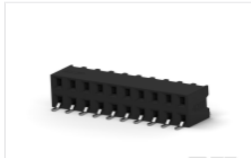
TE Part #2-2307731-0 20P,2MM,B-B,REC,DRHZ,SMD,0.76AU,TR