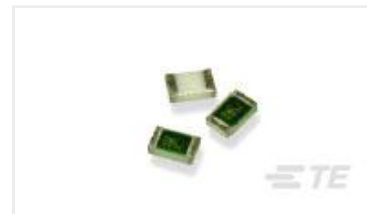
TE Part #1-1614959-1 CPF0805 1M5 0.1% 25PPM 1K RL