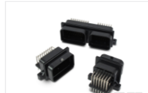
TE Part #CAT-SU763-H342 SUPERSEAL 1.0 Connector Headers