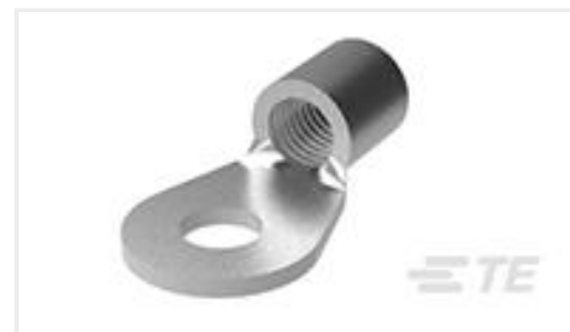
TE Part #322225 TERMINAL,SOLIS R 2/0 3/4