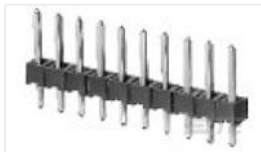
TE Part #5-146282-1 01 MODII HDR SRST B/A .100CL