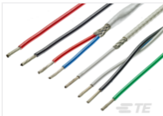
TE Part #3687213001 FLT0111-1.00-0