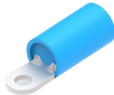
PIDG Terminal (Ring Tongue) Part Number: 324993