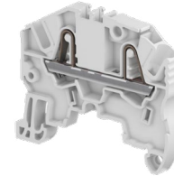
ENTRELEC PI-Spring Terminal Blocks