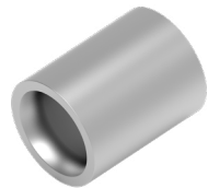
SOLISTRAND Splice Part Number: 34318