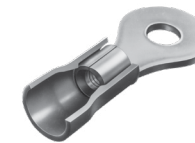
SOLISTRAND Terminal (Ring Tongue) Part Number: 33461