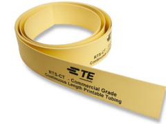
Continuous Tube Commercial Grade RPS-CT