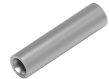
SOLISTRAND Splice Part Number: 330367