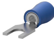
PIDG Terminal (spade Tongue) Part Number: 130527