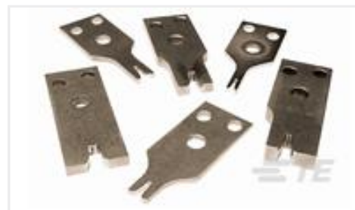
TE Part #467342-2 CRIMPER, RIGHT HAND (16-14)