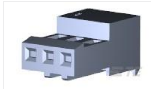
TE Part #3-640440-3 03P MTA100 CONN ASSY 22AWG RED