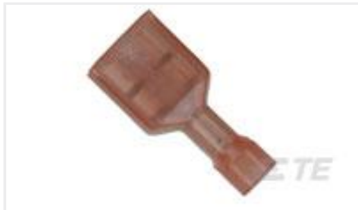
TE Part #2-520183-2 ULTRAFast 250 ASY REC 22-18 TPBR