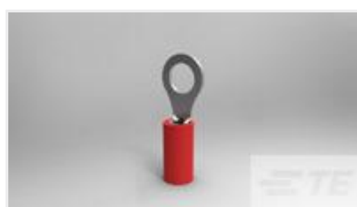
TE Part #2-36154-2 PIDG 22-16 22-18 MIL R 10;TAPE