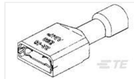
TE Part #2-520084-2 ULTRAFast 110 ASSY REC 22-18 TPBR LP