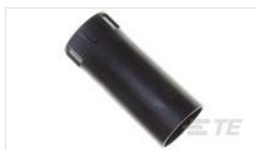
TE Part #54011-1 CPC STRAIN RELIEF,SIZE 17