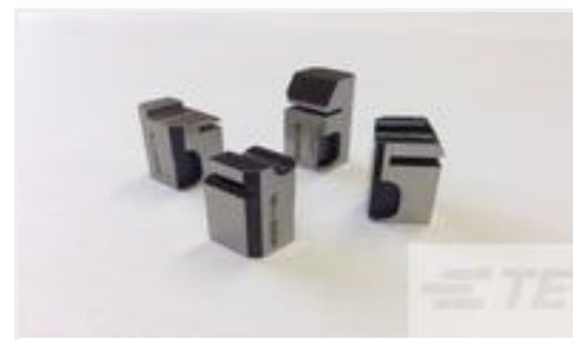
TE Part #467500-1 FLOATING SHEAR