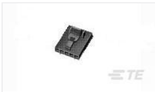
TE Part #104257-2 03 MTE RCPT HSG SR LATCH .100