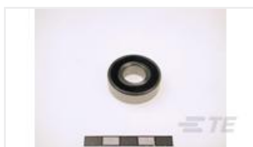
TE Part #6-509109-1 GROOVED BALL BEARING 6202-2RS