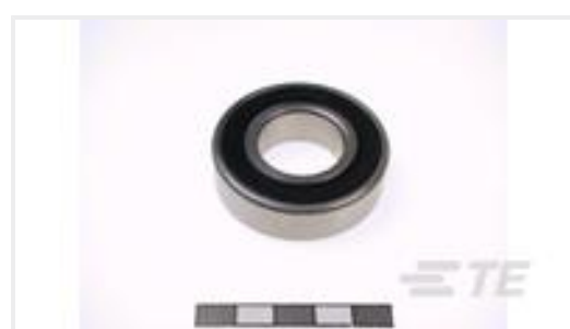
TE Part #5-509098-8 GROOVED BALL BEARING, 6205-2RS