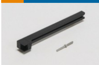
Header & Receptacle Guide Hardware (1)