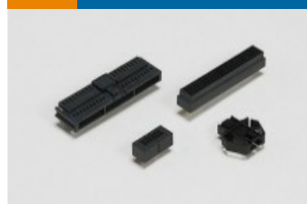
PCB Connector Shrouds (2)