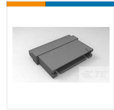
012 HOUSING FFC PIN 100CL SR 1-485893-0