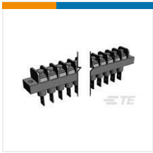
JC6-Q308-12=JC6 ASSEMBLY 796985-9