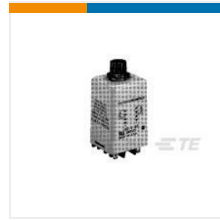
CLB-51-30010=TIME DELAY REL CLB-51-30010