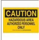
CAUTION Hazardous Area Authorized Personnel Only