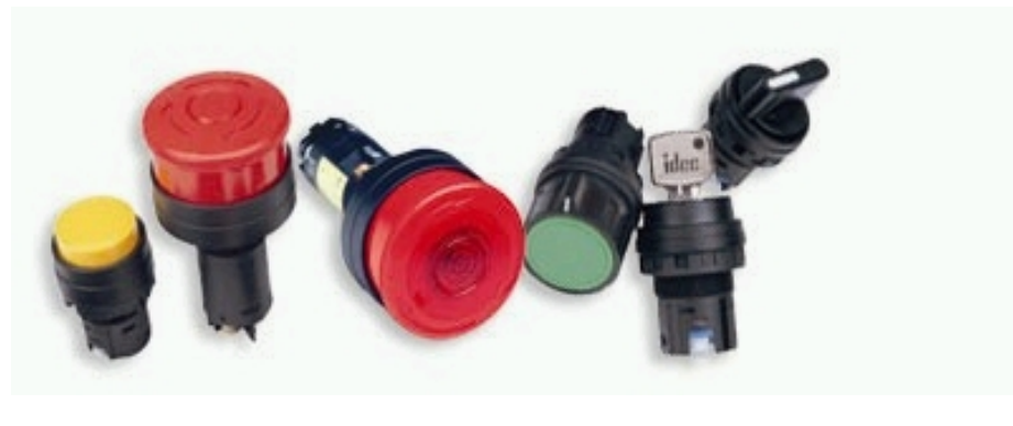
HW1F -31F11QD -A-120V

[IEC style industrial switches, pilot devices and EStops]