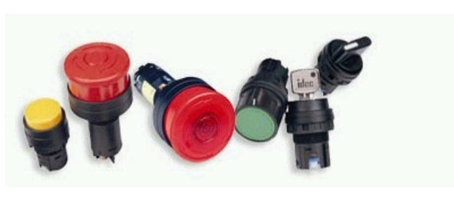
HW1F -31F20QD -R-6V

[IEC style industrial switches, pilot devices and EStops]