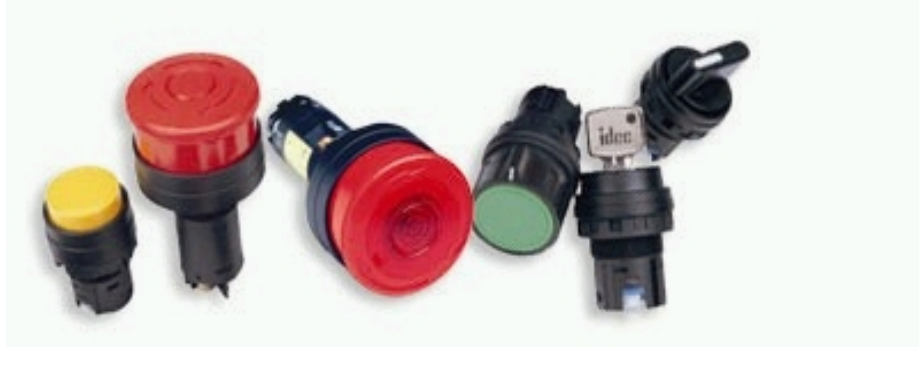
HW1P -2QD -W-120V

[IEC style industrial switches, pilot devices and EStops]