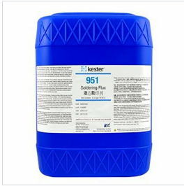
951 Soldering Flux