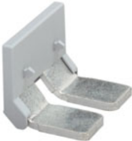
Insertion bridge, Pitch: 36 mm, Number of positions: 2, Color: gray

Please be informed that the data shown in this PDF Document is generated from our Online Catalog. Please find the complete data in the user's documentation. Our General Terms of Use for Downloads are valid ( http://phoenixcontact.com/download )