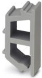
Filler plugs, Width: 6 mm, Number of positions: 0, Color: gray

Please be informed that the data shown in this PDF Document is generated from our Online Catalog. Please find the complete data in the user's documentation. Our General Terms of Use for Downloads are valid ( http://phoenixcontact.com/download )