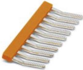
Insertion bridge, 10-pos., divisible, fully insulated

Please be informed that the data shown in this PDF Document is generated from our Online Catalog. Please find the complete data in the user's documentation. Our General Terms of Use for Downloads are valid ( http://phoenixcontact.com/download )