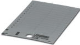
The figure shows a version of the article

Plastic label, Card, silver, unlabeled, can be labeled with: BLUEMARK ID COLOR, BLUEMARK ID, THERMOMARK PRIME, THERMOMARK CARD 2.0, THERMOMARK CARD, mounting type: adhesive, lettering field size: 85.6 x 54 mm, Number of individual labels: 2