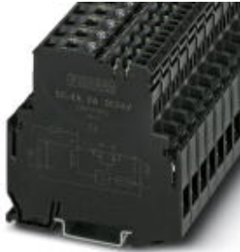
Electronic circuit breaker, signal contact: 1 N/C contact, nominal current: 8 A

Please be informed that the data shown in this PDF Document is generated from our Online Catalog. Please find the complete data in the user's documentation. Our General Terms of Use for Downloads are valid ( http://phoenixcontact.com/download )