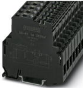
Electronic circuit breaker, 1 reset input, nominal current: 4 A

Please be informed that the data shown in this PDF Document is generated from our Online Catalog. Please find the complete data in the user's documentation. Our General Terms of Use for Downloads are valid ( http://phoenixcontact.com/download )