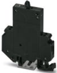
Thermomagnetic circuit breaker, 1-pos., fast blow, 1 N/C contact, with universal foot for mounting on NS 32 or NS 35

Please be informed that the data shown in this PDF Document is generated from our Online Catalog. Please find the complete data in the user's documentation. Our General Terms of Use for Downloads are valid ( http://phoenixcontact.com/download )