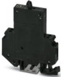
Thermomagnetic circuit breaker, 1-pos., normal blow, 1 N/O contact, with universal foot for mounting on NS 32 or NS 35

Please be informed that the data shown in this PDF Document is generated from our Online Catalog. Please find the complete data in the user's documentation. Our General Terms of Use for Downloads are valid ( http://phoenixcontact.com/download )