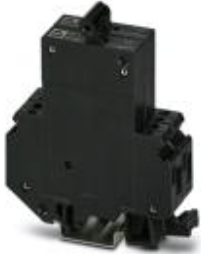
Thermomagnetic circuit breaker, 2-pos., fast blow, 1 N/O contact and 1 N/C contact, with universal foot for mounting on NS 32 or NS 35

Please be informed that the data shown in this PDF Document is generated from our Online Catalog. Please find the complete data in the user's documentation. Our General Terms of Use for Downloads are valid ( http://phoenixcontact.com/download )