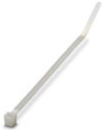
Cable tie, dimensions: L x W, 190 x 4.8 mm, color: transparent

Please be informed that the data shown in this PDF Document is generated from our Online Catalog. Please find the complete data in the user's documentation. Our General Terms of Use for Downloads are valid ( http://phoenixcontact.com/download )