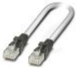
Patch cable, CAT5, assembled, 2 m

Patch cable - FL CAT5 PATCH 2,0 - 2832289