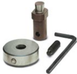
Stamping bit, for bore holes: 8.4 mm diam

Please be informed that the data shown in this PDF Document is generated from our Online Catalog. Please find the complete data in the user's documentation. Our General Terms of Use for Downloads are valid ( http://phoenixcontact.com/download )