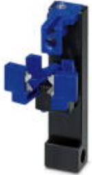
Replacement processing insert 2.5 mm 2 , for the crimping device CF 3000-2,5

Please be informed that the data shown in this PDF Document is generated from our Online Catalog. Please find the complete data in the user's documentation. Our General Terms of Use for Downloads are valid ( http://phoenixcontact.com/download )