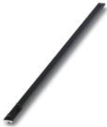
Measuring bar, version: inches/metric

Please be informed that the data shown in this PDF Document is generated from our Online Catalog. Please find the complete data in the user's documentation. Our General Terms of Use for Downloads are valid ( http://phoenixcontact.com/download )