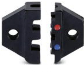
Spare die for CRIMPFOX-RCI 2,5

Please be informed that the data shown in this PDF Document is generated from our Online Catalog. Please find the complete data in the user's documentation. Our General Terms of Use for Downloads are valid ( http://phoenixcontact.com/download )