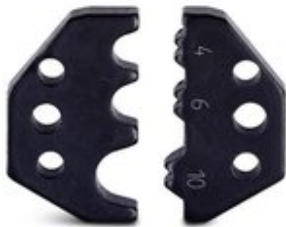
Spare die for CRIMPFOX-RC 10

Please be informed that the data shown in this PDF Document is generated from our Online Catalog. Please find the complete data in the user's documentation. Our General Terms of Use for Downloads are valid ( http://phoenixcontact.com/download )