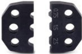
Spare die for CRIMPFOX-RC 2,5

Please be informed that the data shown in this PDF Document is generated from our Online Catalog. Please find the complete data in the user's documentation. Our General Terms of Use for Downloads are valid ( http://phoenixcontact.com/download )