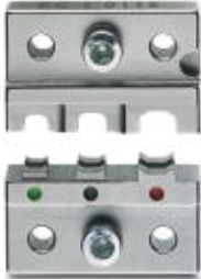
Die for crimping machine CF 500, for insulated cable lugs (C-RCI... and C-FCI...) 0.14 - 1.5 mm 2

Please be informed that the data shown in this PDF Document is generated from our Online Catalog. Please find the complete data in the user's documentation. Our General Terms of Use for Downloads are valid ( http://phoenixcontact.com/download )