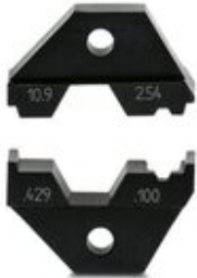
Spare die for CRIMPFOX-CX 10,90

Please be informed that the data shown in this PDF Document is generated from our Online Catalog. Please find the complete data in the user's documentation. Our General Terms of Use for Downloads are valid ( http://phoenixcontact.com/download )