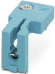
Sleeve receiver for CF 3000-TOOLKIT 0,25

Please be informed that the data shown in this PDF Document is generated from our Online Catalog. Please find the complete data in the user's documentation. Our General Terms of Use for Downloads are valid ( http://phoenixcontact.com/download )