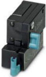
Replacement sleeve feed, for CF 3000-TOOLKIT 0,25

Please be informed that the data shown in this PDF Document is generated from our Online Catalog. Please find the complete data in the user's documentation. Our General Terms of Use for Downloads are valid ( http://phoenixcontact.com/download )