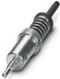
Service tool, for CF-CRIMPHANDY 1,5, for rectifying malfunctions

Please be informed that the data shown in this PDF Document is generated from our Online Catalog. Please find the complete data in the user's documentation. Our General Terms of Use for Downloads are valid ( http://phoenixcontact.com/download )