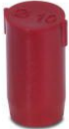
Closing cap, material: PA, for threads pluggable, color: red

Please be informed that the data shown in this PDF Document is generated from our Online Catalog. Please find the complete data in the user's documentation. Our General Terms of Use for Downloads are valid ( http://phoenixcontact.com/download )