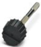
Fillister head screw with plastic knurl, M3 x 40

Screw - SAC-V-SCREW-M3-29 KNURL - 1403779