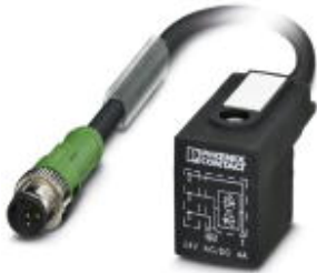
Sensor/actuator cable, 3-position, PUR halogen-free, black-gray RAL 7021, Plug straight M12, on Valve connector BI (11 mm), cable length: 3 m

Please be informed that the data shown in this PDF Document is generated from our Online Catalog. Please find the complete data in the user's documentation. Our General Terms of Use for Downloads are valid ( http://phoenixcontact.com/download )