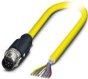
Sensor/Actuator cable, 8-position, PVC, yellow, shielded, Plug straight M12 SPEEDCON, A-coded, on free cable end, Cable length: 10 m

Please be informed that the data shown in this PDF Document is generated from our Online Catalog. Please find the complete data in the user's documentation. Our General Terms of Use for Downloads are valid ( http://phoenixcontact.com/download )