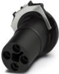
Flush-type connector, Power, 4-position, Socket, straight, M12, T power, PCB mounting, THR solder connection

Please be informed that the data shown in this PDF Document is generated from our Online Catalog. Please find the complete data in the user's documentation. Our General Terms of Use for Downloads are valid ( http://phoenixcontact.com/download )