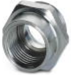
M12 female connector, front mounting THR with M14 screw fastening

Housing screw connection - SACC-DSIV-M12-NUT-9 THR - 1417989