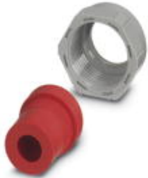
Pg16 screw connection accessories for box mounting base with cable diameter 9 mm ... 12 mm

Please be informed that the data shown in this PDF Document is generated from our Online Catalog. Please find the complete data in the user's documentation. Our General Terms of Use for Downloads are valid ( http://phoenixcontact.com/download )