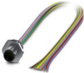
Flush-type connector, Universal, 12-position, Plug, M12, A-coded, Front mounting, M16 x 1.5, Individual wires, cable length: 0.5 m

Please be informed that the data shown in this PDF Document is generated from our Online Catalog. Please find the complete data in the user's documentation. Our General Terms of Use for Downloads are valid ( http://phoenixcontact.com/download )