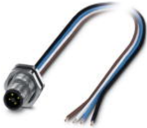
Flush-type connector, Power, 4-position, Plug, M12, T power, Rear mounting, M16 x 1.5, Individual wires, cable length: 0.5 m

Please be informed that the data shown in this PDF Document is generated from our Online Catalog. Please find the complete data in the user's documentation. Our General Terms of Use for Downloads are valid ( http://phoenixcontact.com/download )