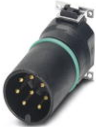
Flush-type connector, 8-position, Plug, Link: straight, Link: M12, A - standard, PCB mounting, SMD

Please be informed that the data shown in this PDF Document is generated from our Online Catalog. Please find the complete data in the user's documentation. Our General Terms of Use for Downloads are valid ( http://phoenixcontact.com/download )