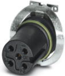
Flush-type connector, 5-position, Socket, Link: straight, Link: M12, A - standard, PCB mounting, SMD

Please be informed that the data shown in this PDF Document is generated from our Online Catalog. Please find the complete data in the user's documentation. Our General Terms of Use for Downloads are valid ( http://phoenixcontact.com/download )