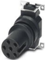
Flush-type connector, 6-position, Socket, Link: straight, Link: M8, A-coded, SMD

Please be informed that the data shown in this PDF Document is generated from our Online Catalog. Please find the complete data in the user's documentation. Our General Terms of Use for Downloads are valid ( http://phoenixcontact.com/download )